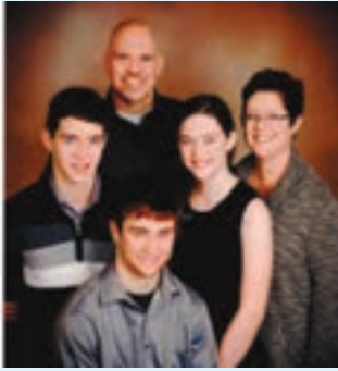
The Halverson Family