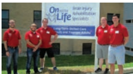
The 2015 Priestly Formation seminary students

For more than a decade, On With Life has been a partner in Creighton University's Priestly Formation program. The students