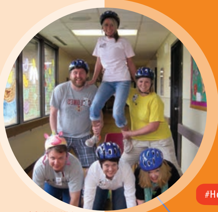
▲ On With Life's Long-Term Skilled Care for Youth and Younger Adults