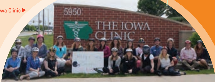
The Iowa Clinic ▶