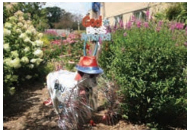
Billy, the garden mascot, is decorated for the Fourth of July.