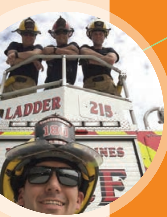
▲ West Des Moines Fire Department

On With Life held a special "Wear Your Helmet at Work" event in May to draw attention and raise awareness of Iowa's absent helmet law. Individuals and organizations from around Iowa submitted pictures wearing their helmets at work. To learn more about Iowa's absent helmet law and to see all of our "Wear Your Helmet at Work" photos, visit onwithlife.org/helmets .