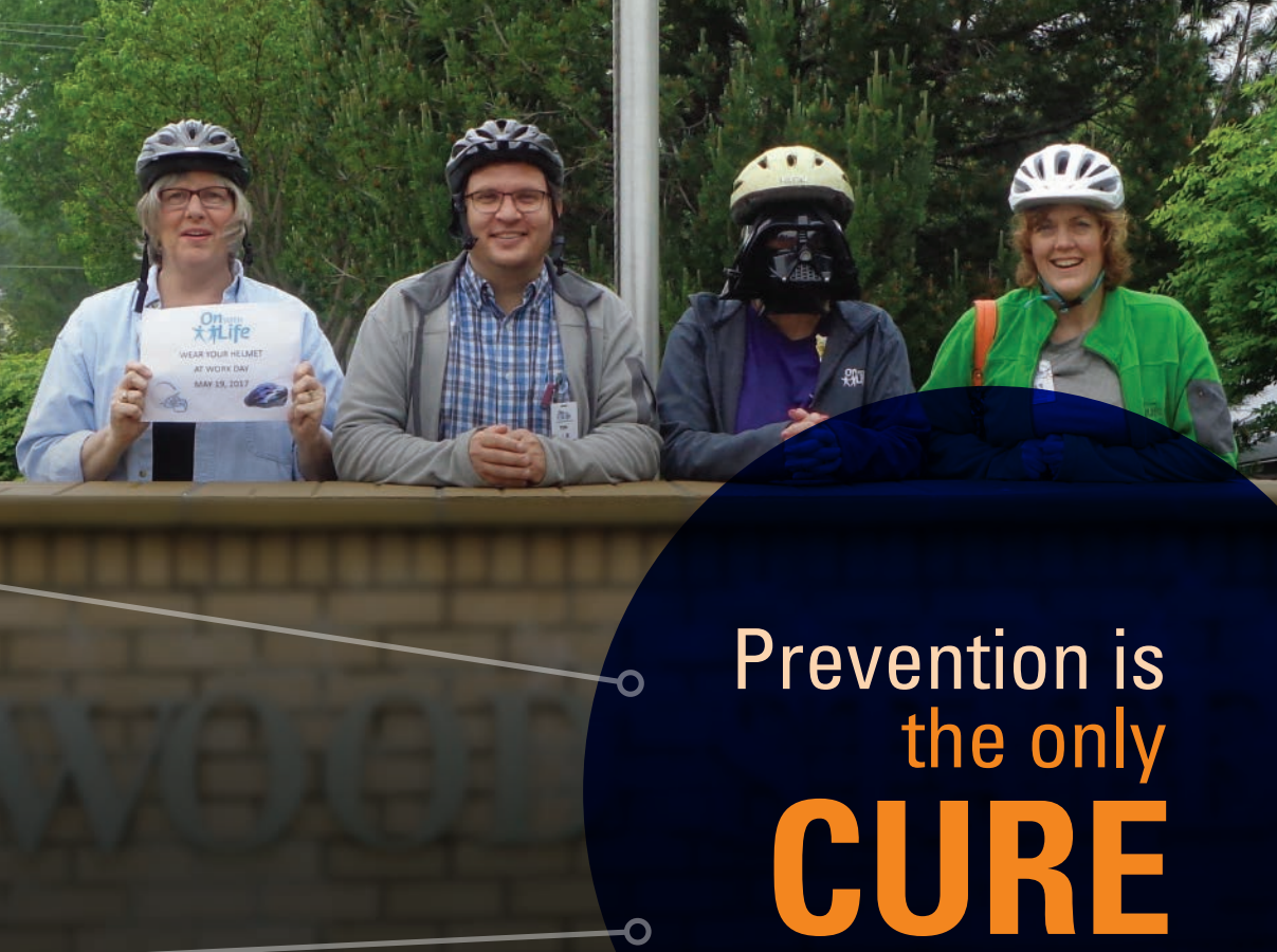
📍 Glenwood State Bank and On With Life Long-Term Program