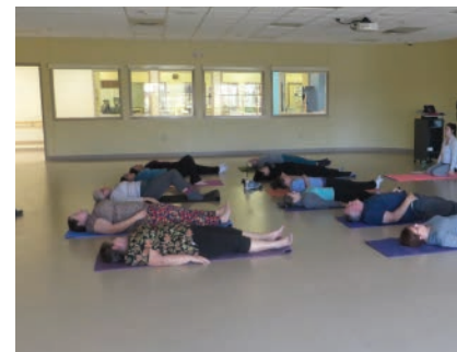
A yoga class held in the new wellness gym, made possible by Principal.