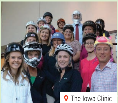
📍 The Iowa Clinic