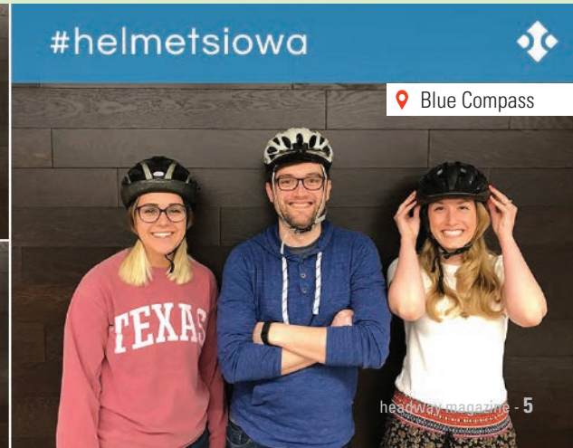
📍 Blue Compass