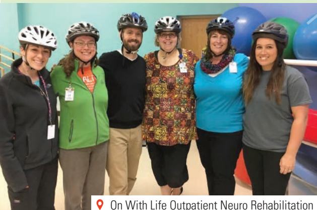
📍 On With Life Outpatient Neuro Rehabilitation