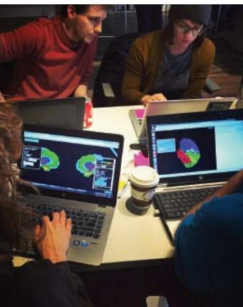
The dsmHack team develops the virtual brain for On With Life's website.