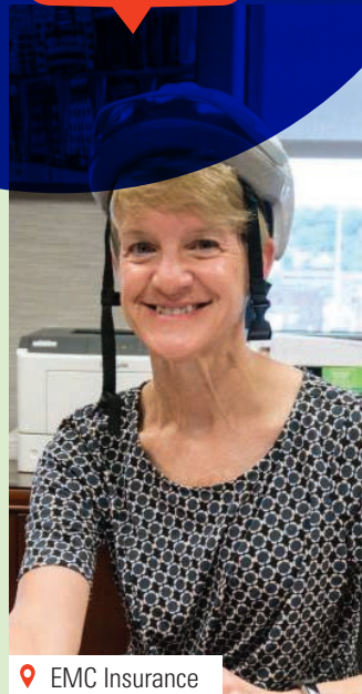
📍 EMC Insurance

At On With Life, we promote the importance of wearing a helmet while riding bikes, motorcycles and skateboards. We're proud to live in a community where so many businesses and organizations also encourage the use of helmets. We held our second annual Wear Your Helmet at Work event to raise awareness for Iowa's absent helmet laws. After all, prevention is the only cure for a brain injury!