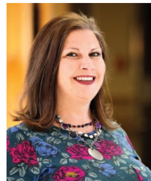
Sonya Brekke Supported Community Living Program

For more information on our Supported Community Living program, visit our website: onwithlife.org/SCL .