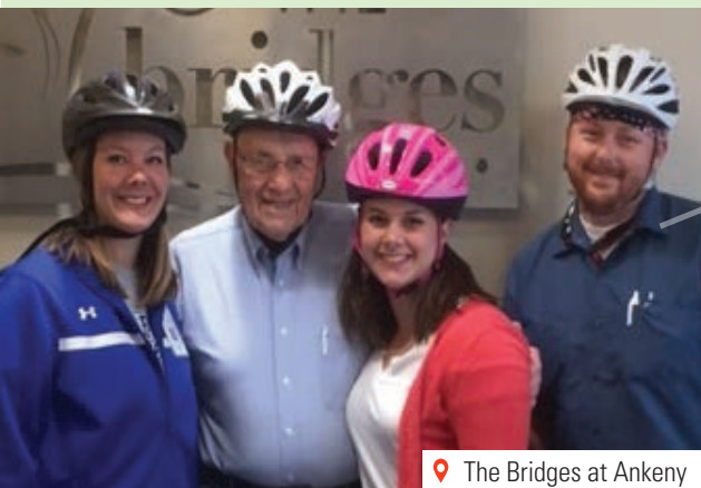
📍 The Bridges at Ankeny

At On With Life, we promote the importance of wearing a helmet while riding bikes, motorcycles and skateboards. We're proud to live in a community where so many businesses and organizations also encourage the use of helmets. We held our second annual Wear Your Helmet at Work event to raise awareness for Iowa's absent helmet laws. After all, prevention is the only cure for a brain injury!