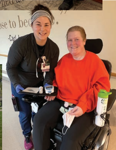
Innovative technology, including a CoaguChek blood draw machine