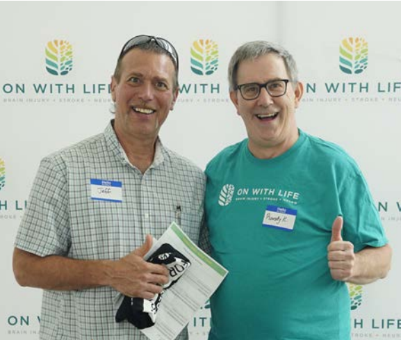
Funding for the annual reunion and t-shirts for attendees