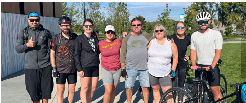
Funding for employee recognition and engagement opportunities