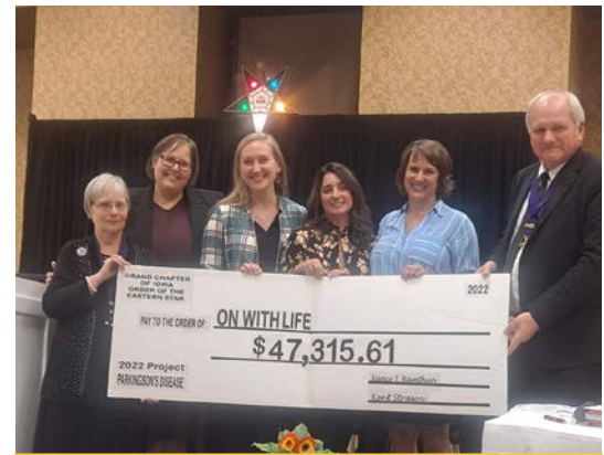
ORDER OF THE EASTERN STAR