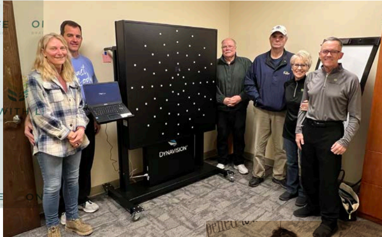
Specialized equipment, including a Dynavision for the Coralville clinic