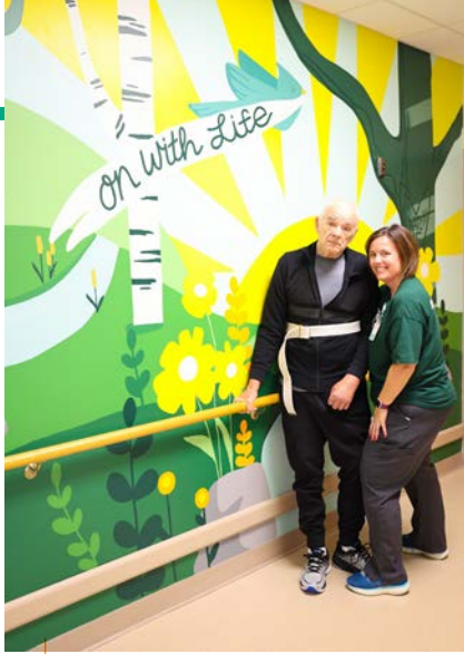
The mural in the Ankeny building

Person served outings, such as this Iowa Cubs game for the Supported Community Living program